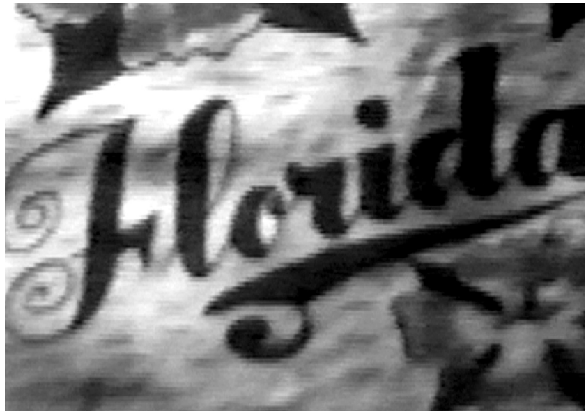
// Figure 3 Peggy Ahwesh with Margie Strosser: Strange Weather (1993). PXL2000 video, sound.