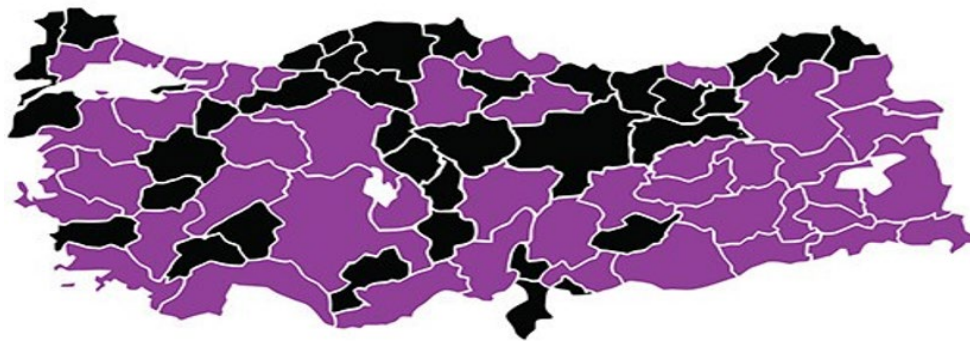
Figure 2: 7 June 2015 National Elections. Provinces with/without Women Deputies. Purple provinces have women MPs, Black provinces have no women MPs.

Figure 2 shows the uneven distribution of women MPs across Turkey's 81 provinces. Although women increased their share of parliamentary seats from 14.4% to 17% in the 2015 national elections, 37 provinces (marked black) had no women MPs at all. These provinces are concentrated in the conservative and nationalist Black Sea and Central Anatolia regions. Conversely, women were more likely to be elected in major cities, such as Istanbul, Ankara, Bursa, Adana, İzmir, and Kayseri. Figure 2 also shows that economic development does not necessarily predict women's political representation. Specifically, East and Southeast Anatolia elected women MPs despite being economically less developed than provinces on Turkey's European side, such as Tekirdağ, Edirne, and Çanakkale, which did not elect any women. The main reason for this is the PDP's (HDP) electoral success based on its nomination policy whereby one woman and one man are nominated as co-presidents. Research into political participation by Kurdish movement parties (Çağlayan 2007; Arslan 2019) indicates that these parties' so-called "women's councils" are independent units whose decisions are not discussed in mixed units. This shows that women's branches positioned as "subsidiaries" in other parties are not a place that "refuses to make real politics" for women in pro-Kurdish parties.