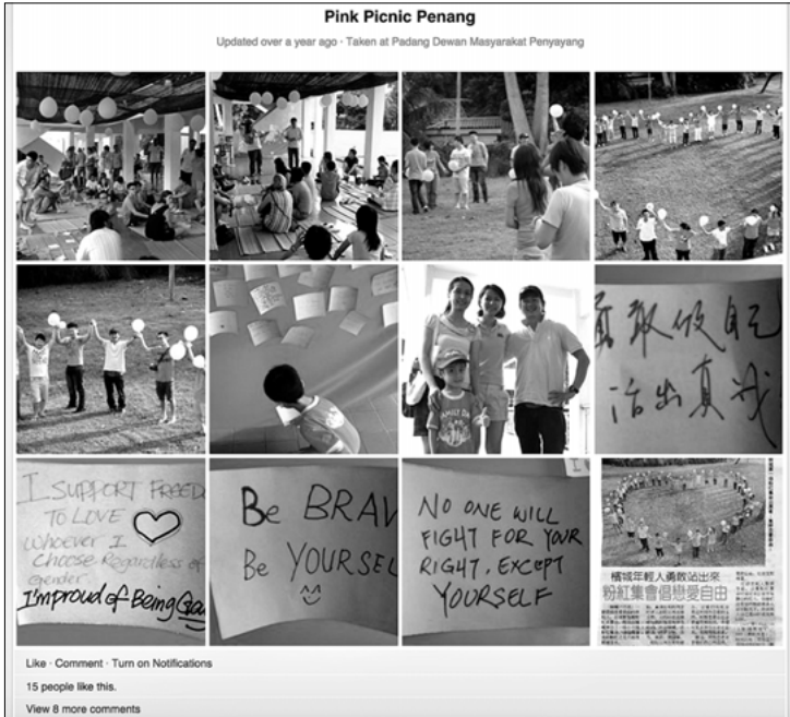
Photo gallery from Facebook account for Seksualiti Merdeka. https://www.facebook.com/groups/SMFestival/ March 2013.

The majority of the group members seem to be LGBT themselves, although it is impossible to acquire any accurate statistical data on this. Most non-gay members, such as myself, are most likely somehow involved in the LGBT community: working or volunteering in NGOs or participating in alternative cultural or political events in Malaysia.