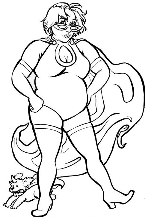
With her sidekick Gusty the unicorn dog, The Zaftig Zephyr spends her nights protecting the rain-spattered streets of Metrolopolis.

— Lorenz created the book after participating in a panel about the lack of fat women in science fiction at a writing convention (Kirby 2013: para 1–2). As noted on the back of the book by the author: "There's a whole universe of bod types out there, and they all deserve to be represented" (Lorenz 2011: back cover). The images include both static and dynamic poses, and many, such as the space unicorn riding fatty, are modelled after real life people involved in fat acceptance. Each image includes a caption, hinting at the story (or backstory) of the image on the page ( fig. 1 ).