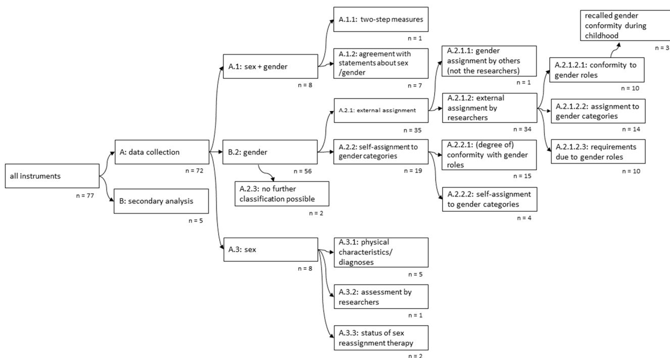
Figure 2. Tree diagram visualising the instruments’ methodology and measured dimensions of sex/gender.

The identified instruments were classified into different subgroups based on their methodology and the dimensions of sex and/or gender that were assessed (Figure 2).