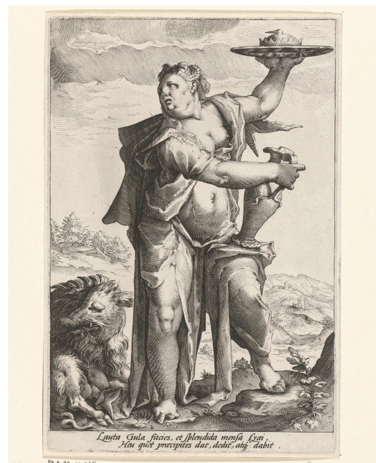
// Figure 3 Jacob Matham after Hendrik Goltzius, Gluttony (Gula) , 1585–1589