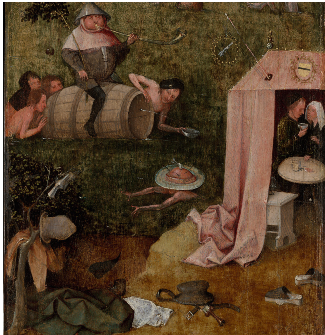
// Figure 1 Hieronymus Bosch, An Allegory of Intemperance , 1495–1500