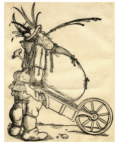
// Figure 4 Hans Weiditz, Winebag and Wheelbarrow , 1521 (circa)

10) „Im alter aber wirts mir schwer/ Wen mir mein grosser wamst steet leer/ Und ist alls durch den Ars gefaren/ Das muss ich waynen in alten Jaren.“