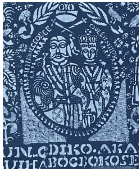
// Figure 02 Adire Oloba (detail of cloth), 20th century, cotton.