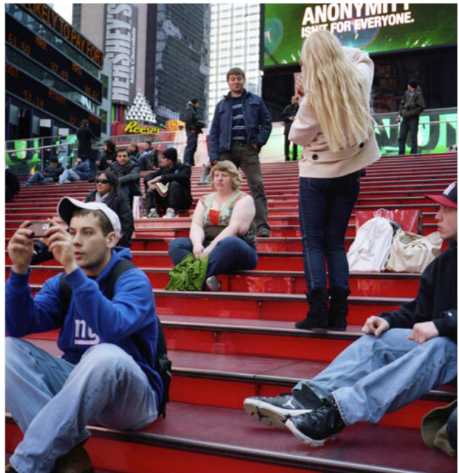
// Figure 1 Haley Morris-Cafiero, Anonymity Isn't For Everyone , 2010. Wait Watchers series, New York, NY

1) For the scope of this paper, discussion of the fields of fat studies and disability studies is primarily centered on research conducted in the U.S.