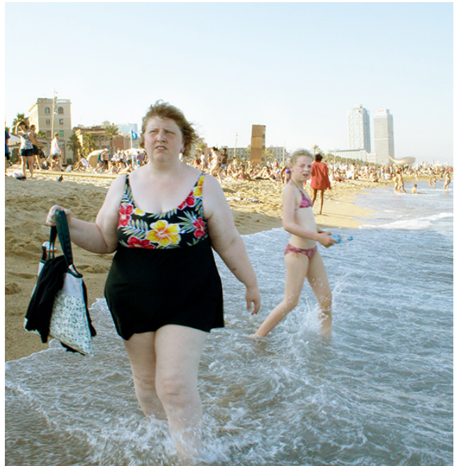
// Figure 5 Haley Morris-Cafiero, Bikini , 2011, Wait Watchers series, Barcelona, Spain

— In both the public spaces and in the photographic images, Morris-Cafiero is presenting her body as a site to be stared at openly. Some critics dismiss her work claiming that she fails to capture the stare of passersby clearly. Morris-Cafiero believes that viewers of her work will draw different conclusions about whether potential glances can be discerned. Not interested in definitively identifying what was captured in the images, Morris-Cafiero is more concerned with the conversation that emerges from viewers who interpret her work. This conversation reveals how viewers aesthetically experience the artist's physical appearance and understand her status within society. This dialogue has been both affirmative and negative, but in all instances it raises consciousness about inherent social biases and the pervasiveness of aesthetic disqualification (Siebers 2010: 21–28). According to Siebers, aesthetic disqualification has long been tied to an established aesthetic model that is used “to qualify some people and disqualify others” (ibid: 21). Individuals who are disqualified for not achieving or being endowed with normative aesthetic qualities are as less than human, their rights are violated, and they are discriminated against. In order to foster a positive identity for all body types we must examine