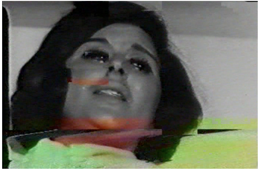
// Figure 2 Rania Stefan, The Three Disappearances of Soad Hosni (2011). Digital video, color, sound, 70 min

and others, who use scavenged VHS “archives” and bootlegged digital images of popular movies and TV shows that are otherwise inaccessible. Stefan’s The Three Disappearances of Soad Hosni (2011, fig.2 ) is composed from 78 VHS tapes of Egyptian movies featuring the beloved actress. In the transfer from 35mm to VHS video to digital file there occur layers of compression, distortion, and loss—like the story of Hosni herself. Analog demagnetization and the artifacts of digital compression become metonymies for the struggle to regain effaced histories and distorted historical knowledge.