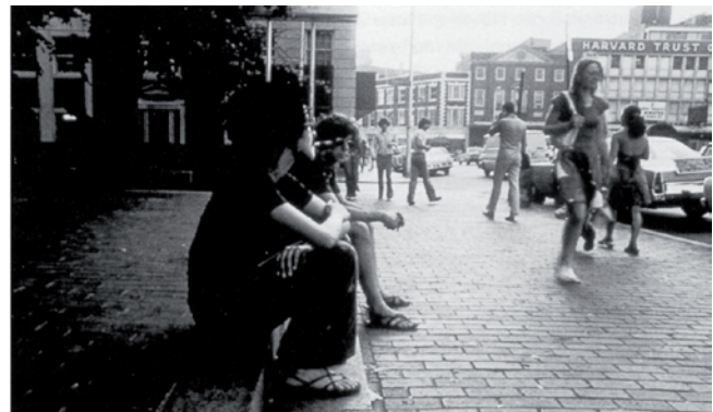
// Figure 04 Adrian Piper, The Mythic Being: Cruising White Women #1 , 1975.

3) „If art is political, it is so only when the following occurs: if the spaces and times it divides, and the forms it assumes to occupy them, are subordinate to the factors that define a political community, namely its apportionments of space and time, subject and object, private and public, and ability and inability“ (Rancière 2006: 94–98).