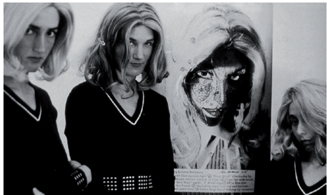
// Figure 03 Lynn Hershman, Roberta Construction Chart #2 , 1974.

— In the early 1970s, Lynn Hershman conjured up Roberta Breitmore , aged thirty, divorced, with $1800 in savings, and who