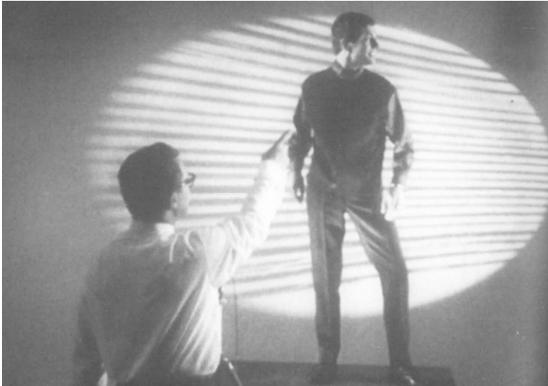
Fig. 6: Studio shooting of men's fashion. UFA WOCHENSCHAU Nr. 323, 1962.