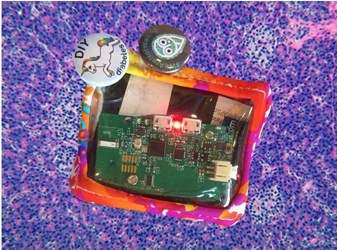
Fig. 2 (Karisa Senavitis, 2017)

OpenAPS was started in 2015 and continues to iterate and grow. Products that can be hacked by patients are seen as a manufacturer's liability (Weiss 2016). But as long as everybody in OpenAPS makes their own pancreas, by only sharing free information, the FDA has no jurisdiction (OpenHumans 2018). In Kosofsky Sedgwicks' sense of the reparative, the group is taking and reconfiguring the materials from the dominant industry to offer more sustenance to their community. The artificial pancreas's multiple, ambiguous presentations and constructions, through an unstable constellation of nodes, is non-normative even when it aspires to pass as the dominant cultural model. The OpenAPS pancreas is open to multiple ways of being and knowing a pancreas.