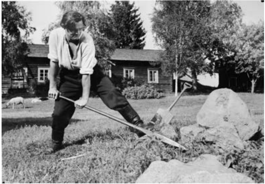
Fig. 33. The patron as a visual spectacle in The Loviisa 1946.

As Juhani, Tauno Palo was represented in a pin-up-like publicity-still that had little significance as a narrative image, but had more significance as an image appealing to the star qualities of Tauno Palo. This still portrays him standing in the courtyard. His pose is relaxed; he is not going anywhere or doing anything, not straining in the sense outlined by Dyer as the quality that “makes man a man” (Dyer 1992/1982, 116). Instead, he stands with his hands resting on his belt, with his hips slightly bent forward, and the lighting emphasizes the stillness of his pose. In retrospect, the pose links the Juhani character to Western heroes à la John Wayne. As Juhani, Tauno Palo does not meet the eyes of the viewer, but gazes off-frame, following the gendering logic of pin-up poses (cf. Dyer 1992/1982, 104). [Fig. 34]