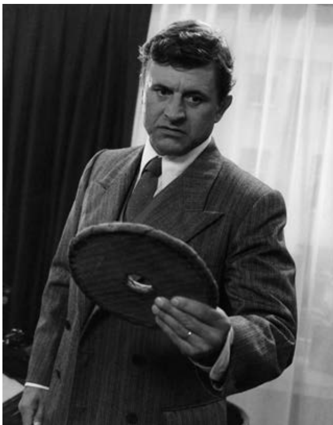
Fig. 40. Rehabilitating Aarne as a subject of history in Niskavuori 1984.