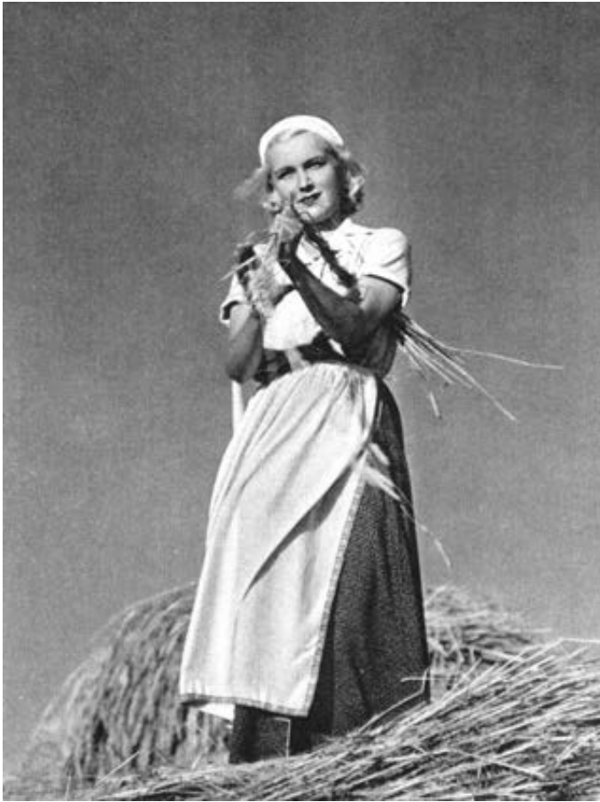
Fig. 18. Post-war Niskavuori films echoed the contemporary imagery of books representing Finland through photographs such as Suomi kuvina – Finland i ord och bild (Finland in Pictures).

and Eino Mäkinen's Isien työ ( The Work of Fathers , 1953), providing the image of Loviisa with yet another intertextual framework.