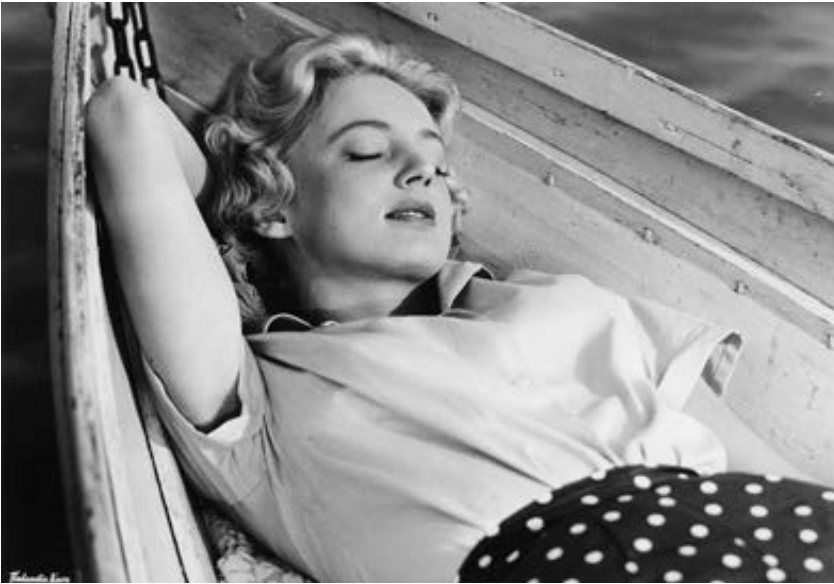
Fig. 61. The Women of Niskavuori 1958 (FFA) reiterated the visual rhetoric of the 1938 version, portraying the female star both as desirable and desiring.

Niskavuori was introduced not only within frameworks of ideological battles and social problems, but also those of the intertwined discourses on sexuality and cinema. [Fig. 56, 61–62.]