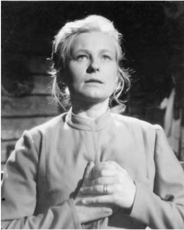
Fig. 16. The making of the monument-woman in Loviisa 1946.