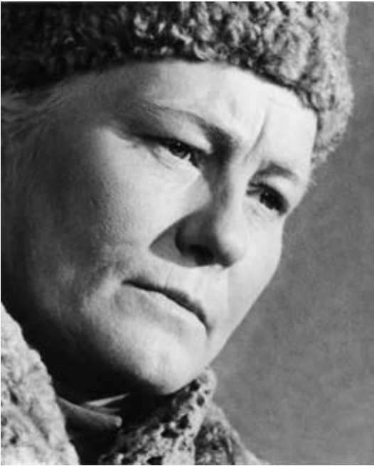
Fig. 19. The matron as a matriarchal monster in The Women of Niskavuori 1958 (FFA).

magazines – as the main reason for the “effeminization” of men. 184 In 1936, Eeva , the “magazine for the modern woman” launched that year, discussed the question of working mothers under a rubric that underlined the instability of gender: “Society becomes more feminine, women become more masculine”. 185 In the inter-war era, the “masculinization of women” was perceived as a major threat to the institution of marriage (Ahlman 1934, 306; Hapuli 1995, 160–167). The legacy of the monument-woman as a masculine woman accentuates the ambivalence of the figuration. While the figure of the Niskavuori matron was, in the 1930s, often read as an embodiment of stability and tradition, it associated with a legacy that, instead, connoted instability and subversion in terms of gender discourse. Both before and after the Second World War, the qualities Mikko Lehtonen (1995) identifies as “masculine” in the matron served as the raison d’être for her significance and power. Simultaneously, the very same qualities propelled discussions of the matron as a “smother”. [Fig. 19]