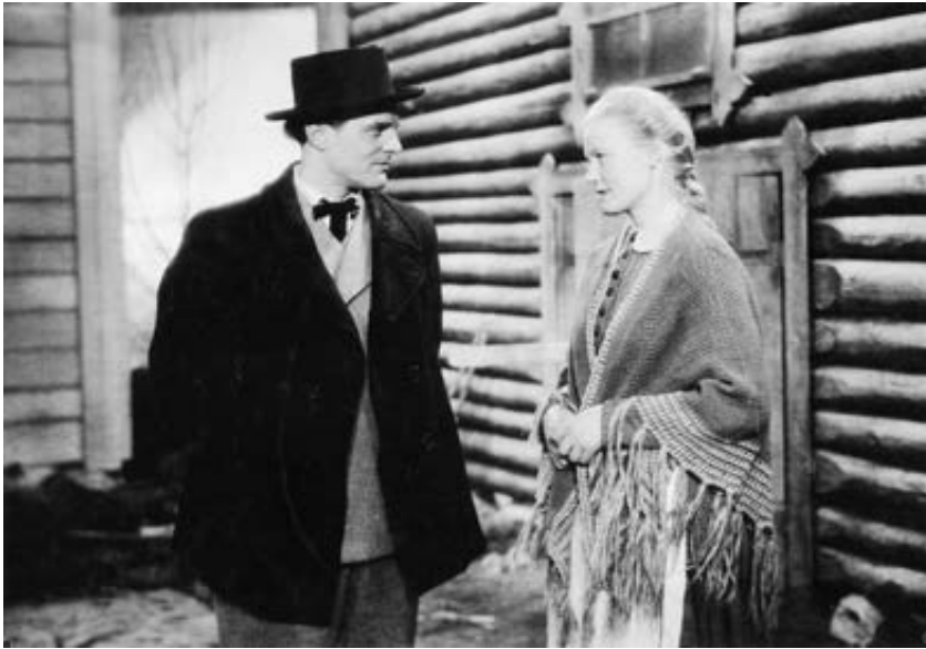
Fig. 15. Not yet a matron, demure, and full of expectation. Loviisa 1946 (FFA).

to which monumentality and matronhood as a gender position resulted from necessity, out of an “unavoidable” encounter with “the realities of life”: