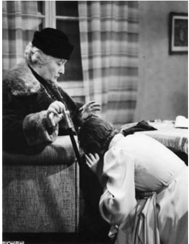
Fig. 13. Underlining the tension between interior feelings and exterior signs in The Women of Niskavuori 1938 (FFA).