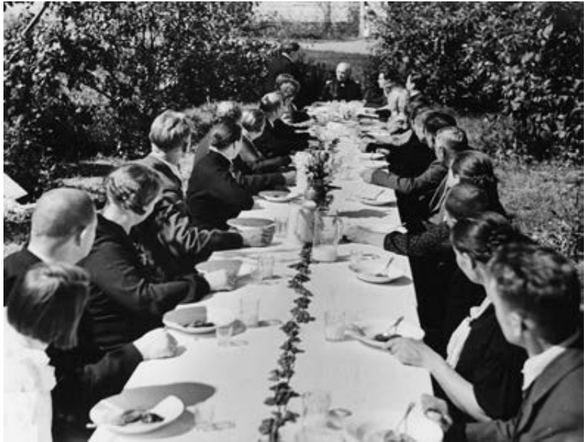
Fig. 11. Monumentalizing the matron in The Women of Niskavuori 1938.

and we will remain pillars in our own manner.” The notion of monumentality has been, ever since, an especially persistent reading in the context of theatre. 17 In this section, I look at the 1930s interpretive framings to examine how the character of the old matron was seen as monumental (what was monumental about her?) and in what sense (what was she a monument to?).