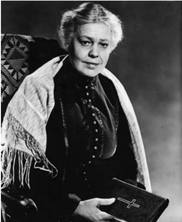
Fig. 24. The visual attributes of the old matron include a rocking chair, a knitted shawl, and a stick, as portrayed in a publicity-still for Aarne Niskavuori 1954.

flaunting the notion of a never-ending story. In addition, her command of her children, emphasized in earlier framings, expanded to gain nothing less than an international and global dimension: