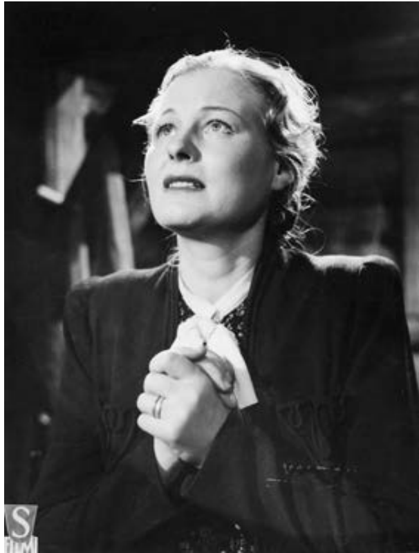
Fig. 17. The moment of glorification in The Glorified Heart 1943 (FFA).

a-monument, becoming-a-matron. They were designated as evidence of disappointment, anger, and bitterness, and as evidence of sorrow, soulfulness, and “femininity”. Indeed, the melodrama of the monument comprised this tension and suggested incommensurability between the matron qualities and the “feminine” virtues that the 1947 book The Loving Heart called softness and heartiness. (Valentin in Kaari 1947, 66–67; cf. Häggman 1994, 187.) Both this book and Loviisa monumentalized an ambivalent construction of the monument-woman. In the narrative image of Loviisa, as constructed in the interpretive framings, the monumental was defined as “becoming monumental” both in the sense of becoming strong and hard and in the sense of suppression. In this manner, the monumental “Finnish woman” of the Niskavuori film was postulated a “loving heart”; beneath the hard surface (performing the matron), there were traces of the young romantic woman, “sweet femininity and radiant tenderness” (performing the woman). 97 In a retrospective reading, Emma Väänänen’s performance of Loviisa has been