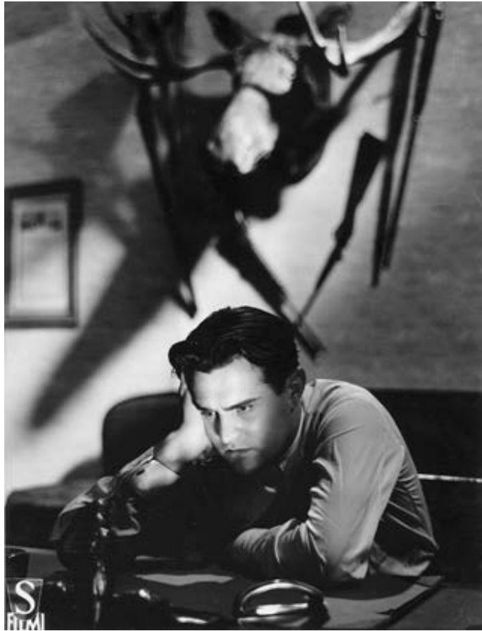
Fig. 27. Aarne as the man-in-crisis in The Women of Niskavuori 1938 (FFA).

The right-wing newspaper Ajan Suunta described Aarne through analogy to the “obscure and meaningless” male character in F. E. Sillanpää’s “lousy piece of work”, the novel Miehen tie ( The Man’s Path 1932). According to the reviewer, Aarne Niskavuori and Paavo Ahrola were “similar good-for-nothings”. 59 This intertextual framework indicates a reading of The Women of Niskavuori in terms of the “vitalistic” discourses on gender and sexuality. 60 In Lasse Koskela’s (1988, 150) reading of Sillanpää, “a man does not control his own path” and “the man does not understand it”. 61 Instead, his own unconscious mental images and women are the two forces which determine his path. The title of the novel, which refers to the Old Testament, indeed offers manliness as a question of self and identity: Who or what determines “the