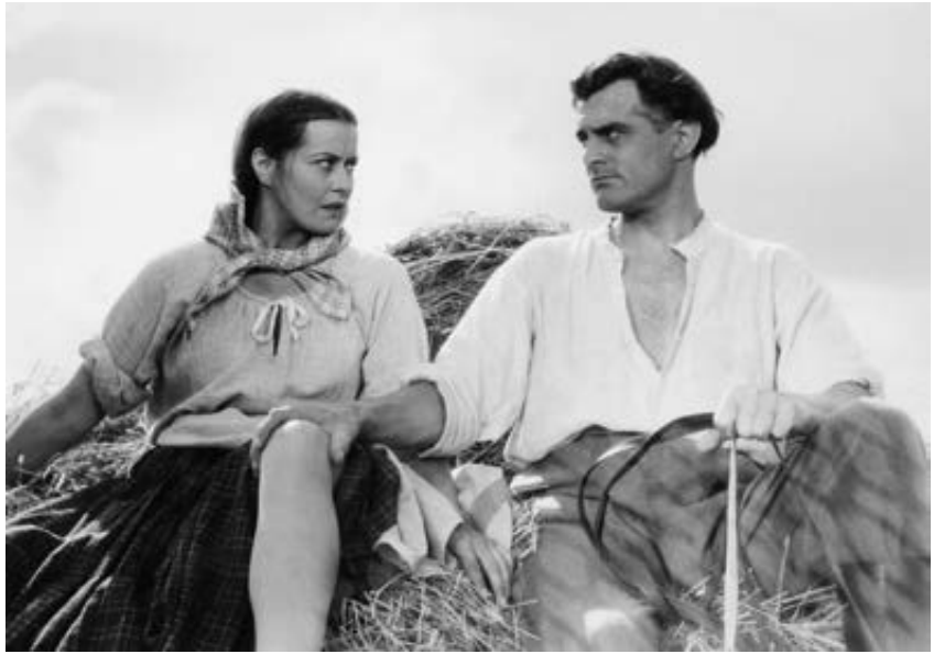
Fig. 41. Passion and transgression in Loviisa 1946.

“In Loviisa , the love between Juhani and Malviina is born on the field, in direct communion with the land, without the mediating factor of money or commodities. Vaala alternates between shots of Juhani and Malviina walking towards each other and close-ups and long shots of their encounter. In this manner, he binds the couple together as if through magnetism and harmoniously merges them with the nature; this mode is downright biological. The symmetry of images endows the relationship with a powerful, deterministic nature. It is as if a dam were about to burst.” 37