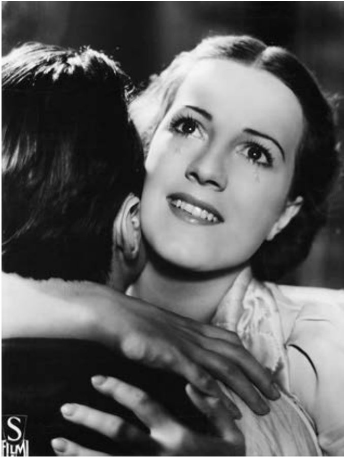
Fig. 60. In the 1930s, Finnish film critics employed Balázsian ideas of film, emphasizing the facial close-up as the locus of the cinematic. Even those critical of Wuolijoki admired Sirkka Sari's "soulful" eyes in The Women of Niskavuori 1938 (FFA).

welcomed the censorship's moral condemnation of Ilona's character, then published promotion articles applauding the beauty of Sirkka Sari and using the star-effect to motivate and legitimate the controversial intrigue: