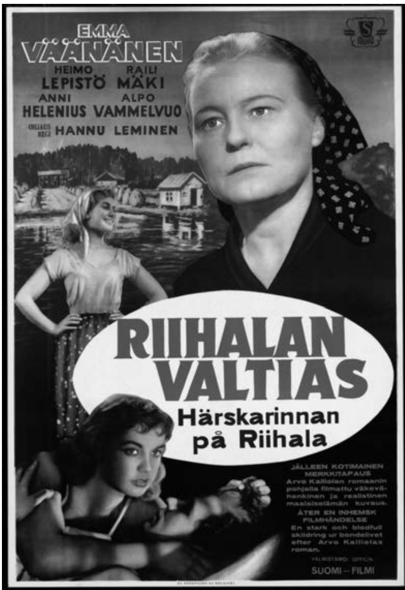
Fig. 20. Pathologizing matronhood in The Ruler of Riihala 1956 (FFA).

A Suomi-Filmi brochure marketed The Ruler of Riihala to an English-speaking audience as The Farmer's Wife :