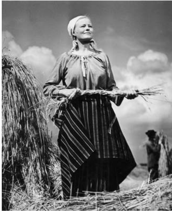
Fig. 14. The monumental peasant woman in Loviisa 1946.