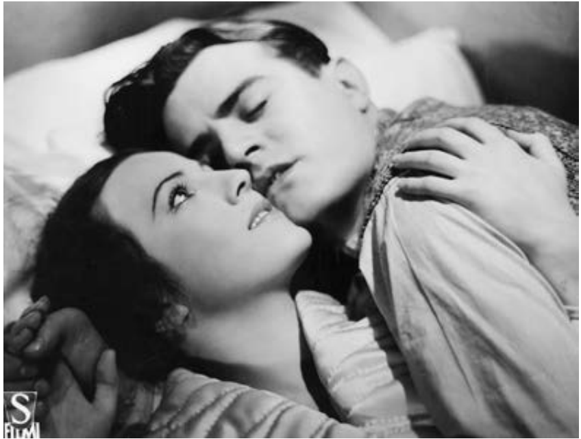
Fig. 54. The censored close-up from The Women of Niskavuori 1938.

advocating moral relativism and objecting to censorship as a moralistic practice pursuing political agendas, 114 most commentators accepted censorship in principle and quite a few newspapers framed The Women of Niskavuori as to some extent “immoral” or ethically suspicious. Interestingly enough, there was a lot of press coverage concerning the censorship decision before the première, whilst many of the actual reviewers refrained from commenting upon the incident at all. 115 As for the public debate, four different yet overlapping approaches to censorship can be discerned: