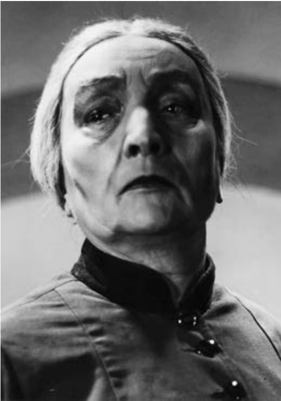
Fig. 12. The matron as a melodramatic monument with “the burn marks left by tears and stifled sighs” in The Women of Niskavuori 1938 (FFA).

cutting hay. A close-up of Loviisa re-emerges, this time a low-angle frame, accompanied, first, by the Bible quote and water rushing in torrents and, second, by a haymaking scene. The landscape scenery fades away and a cut re-introduces the heap of stones, as if on a hill, lit from behind. As the shot with the Bible quote fades away, a superimposition identifies Loviisa with the heap of stones. In the final frame, the heap of stones is framed intact. In this manner, the final montage sequence performed yet another “hardening” of Loviisa from a downward gaze to a monumental framing and identification with the stones. This ending suggested the same duality of hardness (stone-likeness) and softness, the sense of duty and “suffocated sighs” highlighted in the public reception of the film. In addition, a publicity-still widely circulated in promotional publicity and review journalism framed Loviisa in a medium close-up, in low-key lighting, gazing downwards – appearing not as a “solemn” character enjoying her “victory”, but more like a sad, disheartened old woman. 52