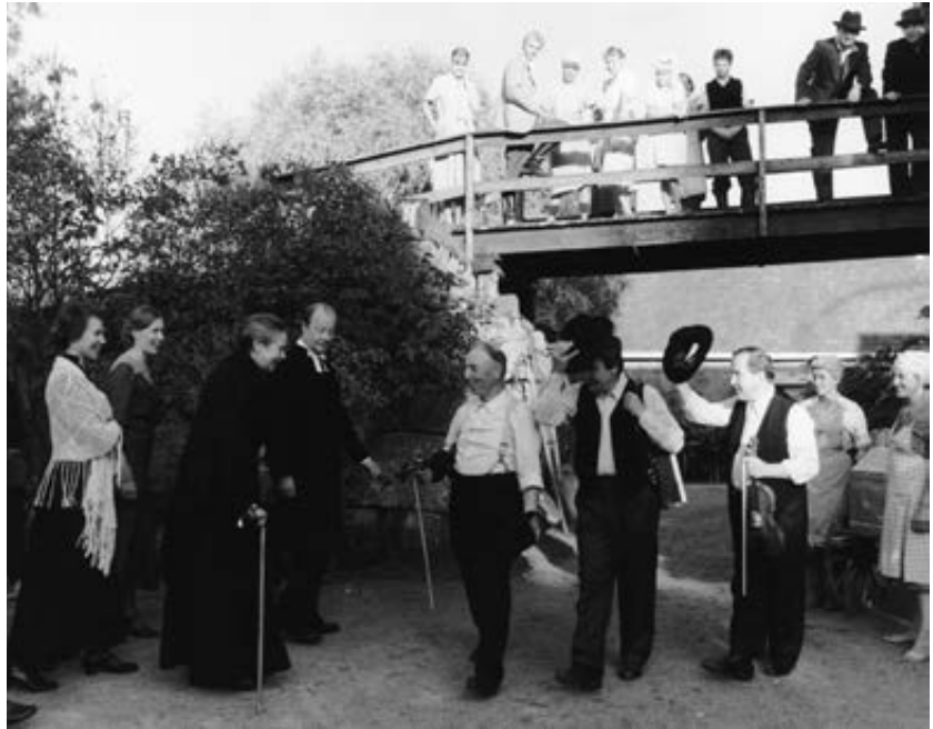
Fig. 4. The heritage aesthetic in Niskavuori 1984 (FFA).

to the past”, “boundless tradition-optimism” and “yearning for tradition”. 85 Furthermore, its release coincided with two other family sagas The Clan – the Tale of the Frogs (1984) and Dirty Story (1984), both set in the recent past. 86 In some readings, Niskavuori was seen as symptomatic of an “artistic crisis” in Finnish cinema; it was interpreted as vying for an established position as national culture by supporting literary, not cinematic, values. 87 This reading has been reiterated, for example, in a 1995 textbook (Honka-Hallila, Laine & Pantti 1995, 204) where “lack of renewal” and “gazing backwards” were named as the leading characteristics of the 1980s domestic film. A cycle of biopics ( Runoilija ja muusa/ The Poet and the Muse 1978, Tulipää/ Flame-Top 1980, Da Capo 1985), literary adaptations such as Suuri illusioini (A Grand Illusion 1985) and historical films such as Vartioitu kylä 1944 (The Guarded Village 1944 1979), Pedon merkki (The Sign of the Beast 1980), Angelas krig (Angela’s War 1984) and Tuntematon Sotilas (The Unknown Soldier 1985) were lumped into one category and called the “backward-looking” “nostalgic front” (ibid., 204–208).