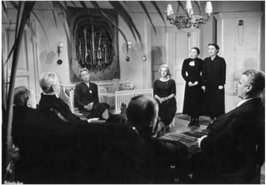
Fig. 59. With publicity-stills referring to the climactic trial scene, the visual framings of The Women of Niskavuori underlined a discourse of repression even in 1958 (FFA).

between the role and the actor in the case of Aarne, Ilona was idealized in spite of the values with which she was identified: