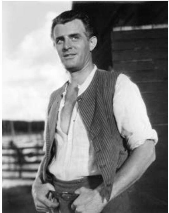
Fig. 34. In a publicity-still for Loviisa 1946 (FFA), Tauno Palo's pin up -pose as Juhani echoes that of Western heroes such as John Wayne.

“Aarne becomes a coherent character [selkenee] and develops a serious manliness, and he has acquired beautiful sensitivity as well.” 117