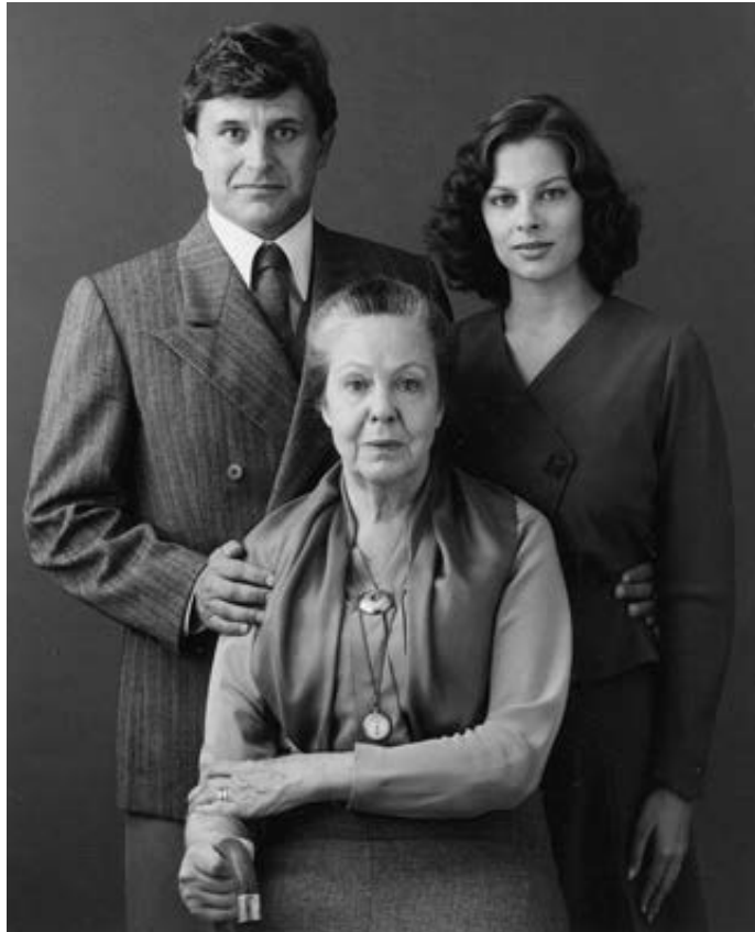
Fig 2. The aesthetic of family album in Niskavuori 1984 (FFA).