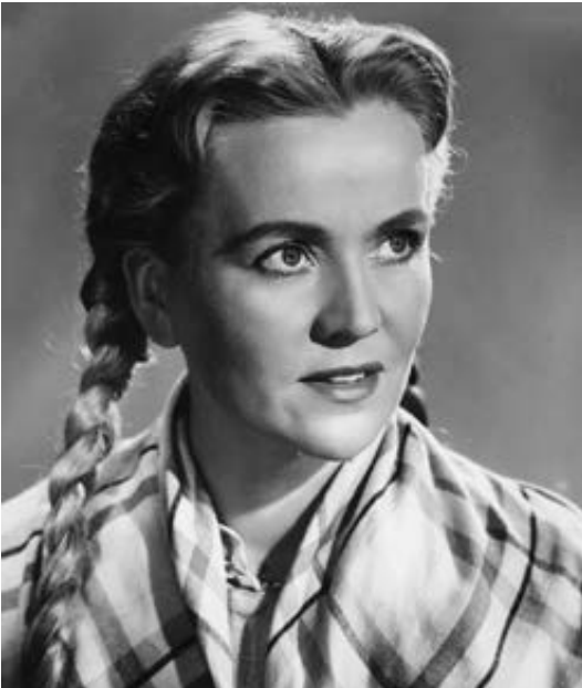
Fig. 47. An image of victimized femininity, Siipirikko was portrayed as an idealized character in Heta Niskavuori 1952 (FFA).

licity photo in which Akusti carries Siipirikko in his arms connotes illness and weakness more than anything else. In these framings, then, Siipirikko not only functioned as a negative of Heta, but also as a projection of Akusti's goodness, serving as a visible sign of his choice and good nature.