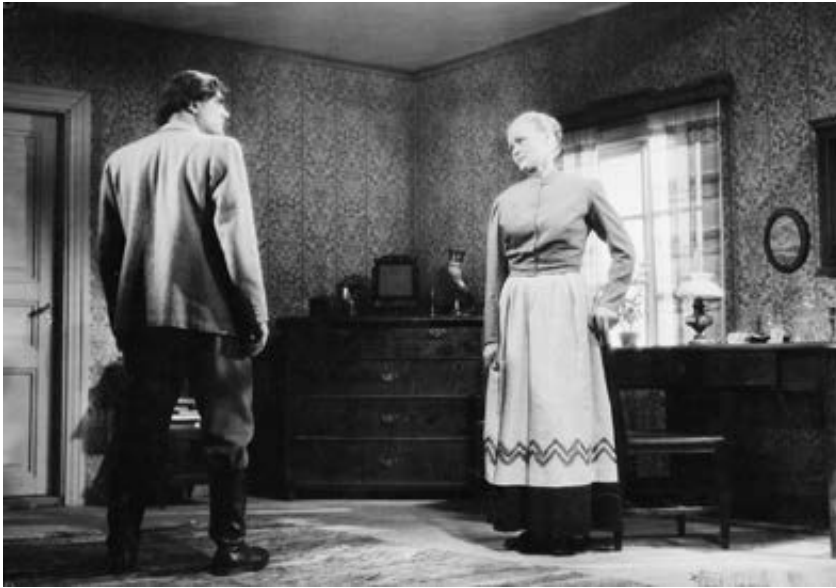
Fig. 28. Juhani “You have sworn obedience to me”; Loviisa “...and you have vowed fidelity”. A marital fight in Loviisa 1946 (FFA).

“As Juhani Niskavuori, Tauno Palo was a typical Niskavuori patron, a womanizer, but unconditional in his emotions. He was tough, strong, serene, and passionate. (...) It was simply amazing that the educated Juhani had nothing else to say than ‘You are beautiful!’ to the educated Malviina.” 92