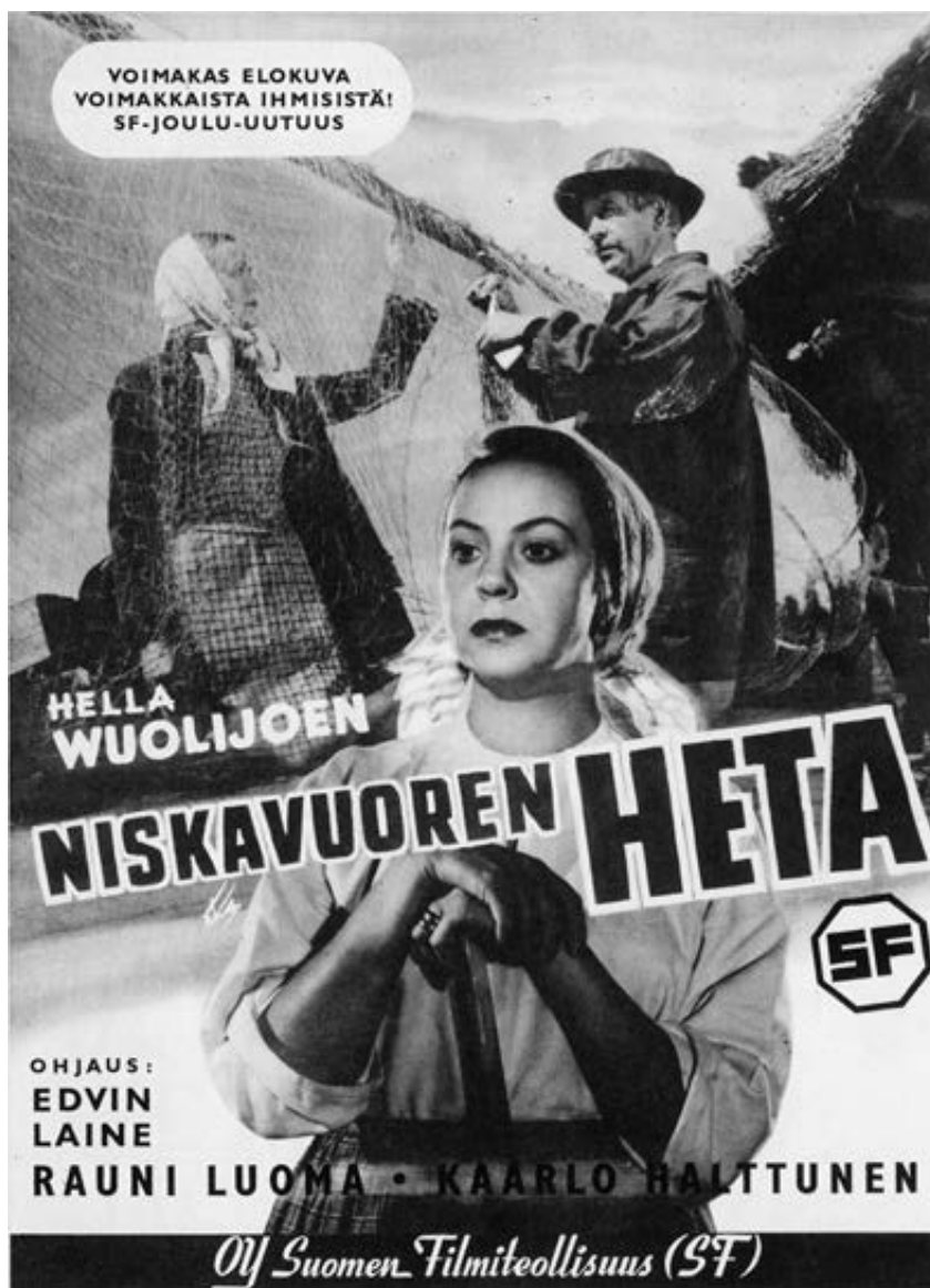
Fig. 9. Advertisement for Heta Niskavuori (EA 24/1952) with a peasant-effect.