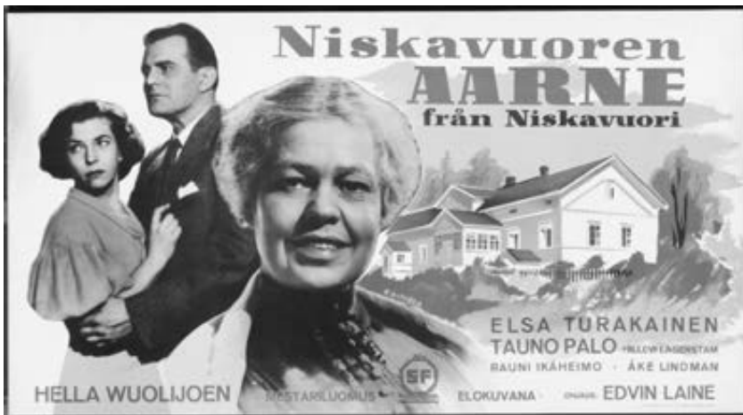
Fig. 8. The Niskavuori estate takes a central position in the poster for Aarne Niskavuori 1954.

where Loviisa is set.” 164 In publicity-stills, the characters and the stars, of course, were equipped with objects of peasant culture. In Loviisa , Loviisa, Juhani, Kustaava, Malviina, and Martti were portrayed with a pail as the sign of the narrative world. Even the poster of the film featured Juhani with a pail. Publicity-stills framing Heta Niskavuori displayed nets and other fishing equipment, and in a studio portrait of Heta, placing a handle of a hoe in her lap created the peasant-effect. [Fig. 9]