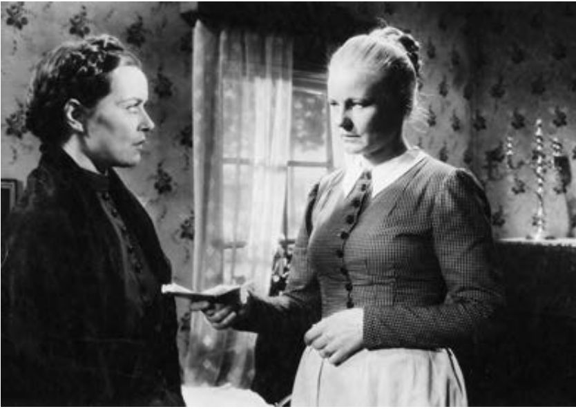
Fig. 46. In Loviisa 1946 (FFA), one has the estate and the money, the other the patron's love.

them both standing and gazing at each other, lighting hierarchizes them by foregrounding the Loviisa character. This still suggests the obvious moral symbolism of Loviisa , familiar from many Finnish films, according to which fair-haired female characters are virtuous, whereas dark hair is coupled with “dark desires” (cf. Salakka 1991, 109–111; Dyer 1997, 28, 57–59). At the same time, however, this still confounds this moral logic as Loviisa , whose forehead is brightly illuminated, is portrayed to offer money to Malviina . Although a dark-haired figure, dressed in black and placed in the shadow, Malviina refuses to accept the money (to trade her love for Juhani for money) and, thus, questions Loviisa 's moral superiority. While the character of Malviina conforms to both sexualizing and “racializing” logic of representation, her “vitality” complicates any stereotyping.