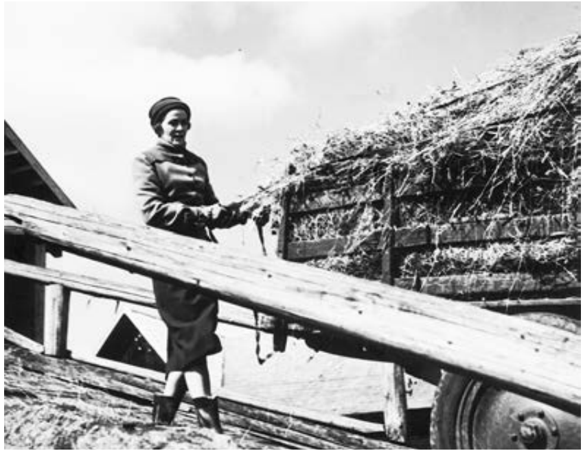
Fig. 5. Niskavuori Fights 1957 (FFA) as a tribute to women's wartime work.

Review journalism, again, contested this framing of Niskavuori Fights as a historical depiction of war efforts. While some framings underlined the reality-effect of the home-front depiction – “the life in Niskavuori during the difficult war years is represented with honesty and liveliness” – and while some reviewers welcomed the “enlargement” of narrative scope beyond Niskavuori family, 111 many framings questioned the status of Niskavuori Fights as a historical narrative about the war years. The prologue of the film, which featured documentary footage of Helsinki being bombed by the Soviet air force, the subsequent fire at the university, as well as staged scenes in bomb shelters, was especially questioned as “loose”, “fragmentary”, or “mysterious”. 112 In other words, according to the review journalism, the documentary footage did not produce the desired history-effect, but instead confused and interrupted the narrative. At issue, however, was not necessarily the footage as such, but the Juhani Mattila (Tauno Palo) character introduced in the prologue. This character generated, in the review journalism, a discussion about history and, at the same time, allowed different articulations of history.