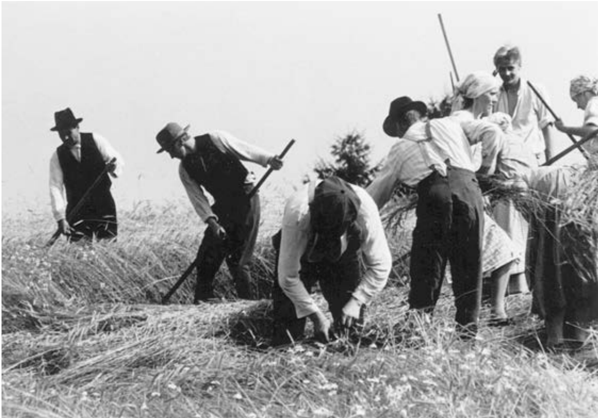
Fig. 3. Simulating old Finnish cinema in Niskavuori 1984.

and called forth the famous scene in Loviisa where Juhani (Tauno Palo) and Malviina (Kirsti Hurme) encounter each other walking across a rye field. The opening sequence of Niskavuori functioned, then, like a thematic and stylistic prologue suggesting a citational reading. After the prologue, a tableau-like scene, the narrative continued with Loviisa's name-day party, a scene familiar from many other Niskavuori films: the two versions of The Women of Niskavuori (1938, 1958), Aarne Niskavuori (1954), and Niskavuori Fights (1957). 82 [Fig. 4]