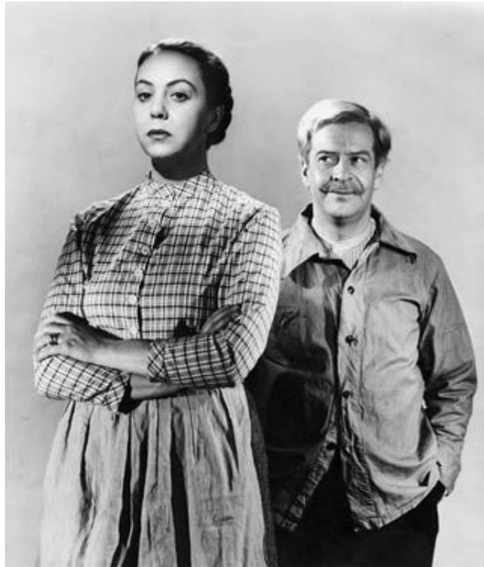
Fig. 35. Heta and Akusti as an unequal couple in Heta Niskavuori 1952.

“The name of the play implies that Heta should be seen as the main protagonist and the whole work as such as created to characterize her and the land-owning class. (...) Akusti has the potential to be more than a reflecting surface for Heta’s pride; in his own manner, he is an apparent counterforce. (...) the good natured fellow, who is not to be addressed as a patron (...), does not raise his voice into a rumble, but talks himself quietly towards his goal, is clever and diplomatic as he leads his wife wherever is necessary. He is not a deceitful man, but one of honour. (...) The meek may not inherit the whole earth, but large areas anyway!” 149