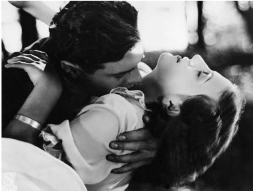
Fig. 56. This publicity-still, quoted even in advertisements for The Women of Niskavuori 1938 (FFA), echoed a rhetoric of passion familiar from, for instance, many Greta Garbo films.

scene. 143 [Fig. 59] In the advertising, the foregrounding of romance linked The Women of Niskavuori to a whole range of 1930s romantic comedies and melodramas. Within the context of cinema culture, as opposed to that of theatre, the image of Ilona was not only discussed in terms of moral principles or symbolic-political resonances, but also “consumed” in relation to the lures and promises of stardom and its connections to heterosexual romance. As Raymond Bellour (2000, 14) argues, the image of the heterosexual couple is “absolutely central” to what he terms “the fiction of a cinema”. According to Bellour, cinema is “powerfully obsessed by the ideology of the family and of marriage, which constitutes its imaginary and symbolic base”. (Cf. Haralovich 1982, esp. 54.)