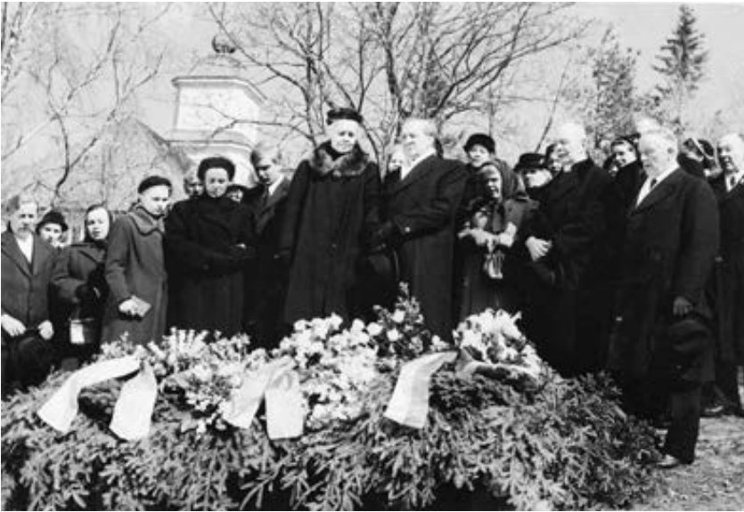
Fig. 6. The soldiers' funeral scene evoked both powerful memories and a sense of history in Niskavuori Fights 1957.

framed both as a communist and a people's democrat, both a conscientious objector and a deserter [käpykaartilainen], or else disavowed as a mysterious figure, leaving the character unmentioned and the history he implicated uninterpreted. 113 In 1957, review journalism reiterated these readings and the conjoining articulations of history. Some framings called attention to a "political tinge", which interfered with "the atmosphere" and promoted a history of the war efforts that excluded the "deserters" and their motifs. Some readings in left-wing newspapers as well as others stated that "political dilution" had taken place, leaving history either unclear ("insinuating but not clarifying") or defective. 114 Some framings rejected what in 1953 had been called "the political bug" as they sought to marginalize a reading of Niskavuori Fights as a representation of political history. Others called for "clearer" interpretations and more "substance" attempting to highlight the missing or suggested political history as the key framework for the narrative. These different framings, nevertheless, both located the point of contest in the political history Juhani Mattila's character and the newsreel aesthetic suggested. 115