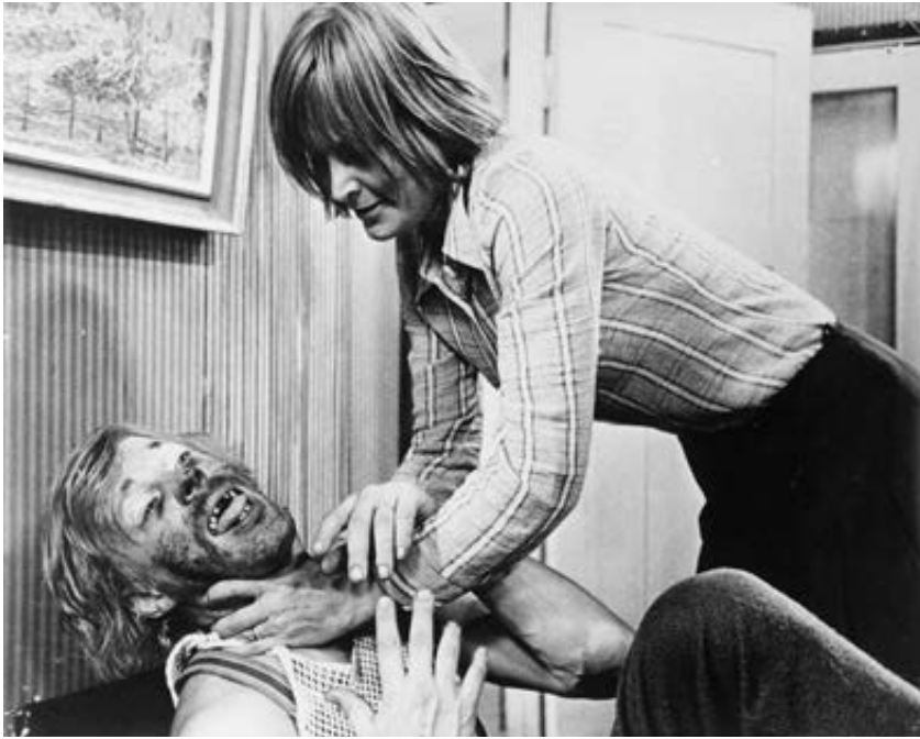
Fig. 26. For 1980s sociologists, the cinematic anti-hero Uuno Turhapuro served as a figure for understanding the victimized Finnish man in the throes of “strong women” and feminist movement. Uuno Turhapuro 1973 (FFA).

a ladies man [naistenmies] and his appearance. Both Tauno Palo himself and Joel Rinne, who was featured in Aarne Niskavuori (1954) and Niskavuori Fights (1957), however, mentioned Niskavuori films as negative examples in terms of their images of men. Joel Rinne said, “The Niskavuori men did not do justice to men. The spirit of that time demanded serving the woman’s lot and position, and this is what Hella Wuolijoki attempted to achieve in her works.” His claim was echoed in Tauno Palo’s comment: