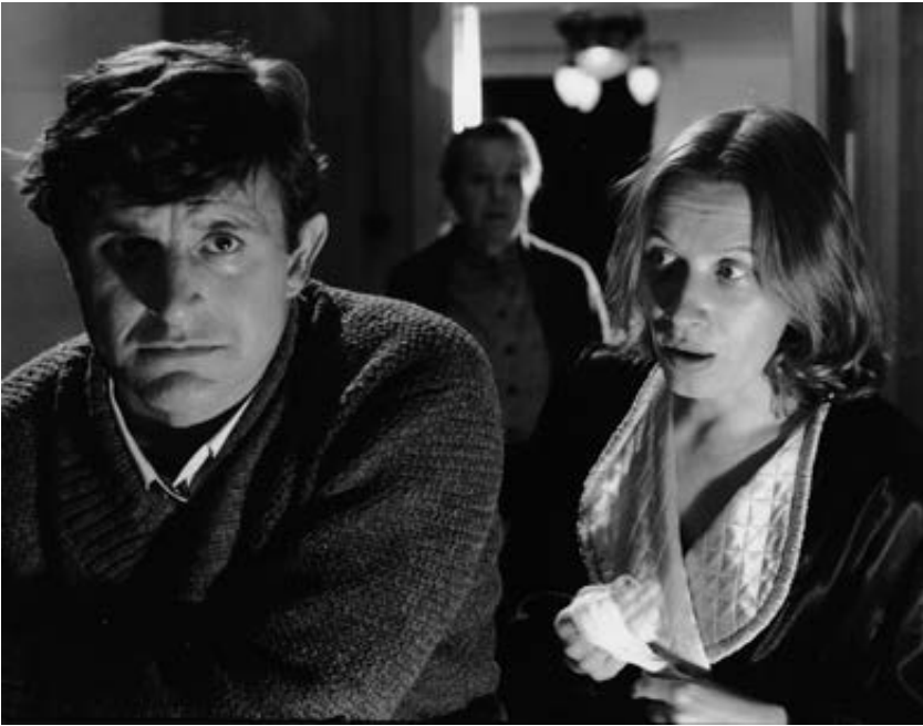
Fig. 38. Publicity-stills positioned Aarne as the protagonist of Niskavuori (1984).

“The central theme of the film is change, Aarne moving away from and returning to the countryside. Aarne is a poor man who is under the thumb [talutusnuorassa kulkeva] of his mother and other strong women. This film investigates what happens to Aarne in town where he cannot see the sunrise the way he could back home at Niskavuori. We explore how it helps him to move back to Niskavuori.” 153