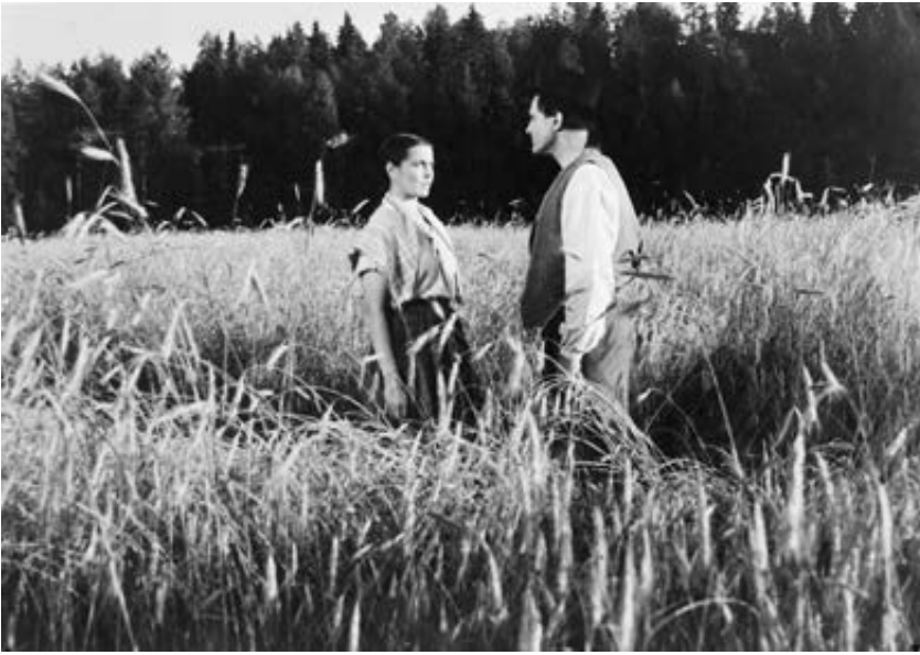
Fig. 42. For 1980s and 1990s critics, this scene in Loviisa 1946 (FFA) epitomized sexual politics as a nature-like force.

“Life on the Niskavuori family estate is represented beautifully. The wind blows; summer clouds roll in the Häme sky and in the burning sunshine, even the passions of the patron Juhani (Tauno Palo) and the voluptuous maid Malviina (Kirsti Hurme) burn.” 40