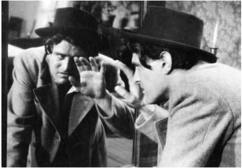
Fig. 29. The patron's identity crisis in Loviisa 1946.

recalled “the inner restlessness” ascribed to Aarne in 1938. Here, he is partly shadowed by a tree and shot in a nocturnal setting referring to the two scenes in which first Loviisa, then Juhani escape to the woods. Lastly, the man-in-crisis, or rather son-in-crisis, is suggested by the still which depicts Juhani in a medium close-up, kneeling beside his mother who has just passed away, and weeping against her sleeve. [Fig. 30]