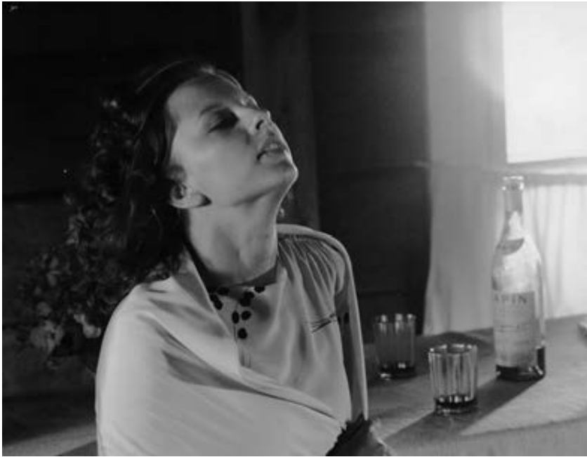
Fig. 62. Sexuality is a key site for historical imagination in heritage films such as Niskavuori 1984 (FFA).