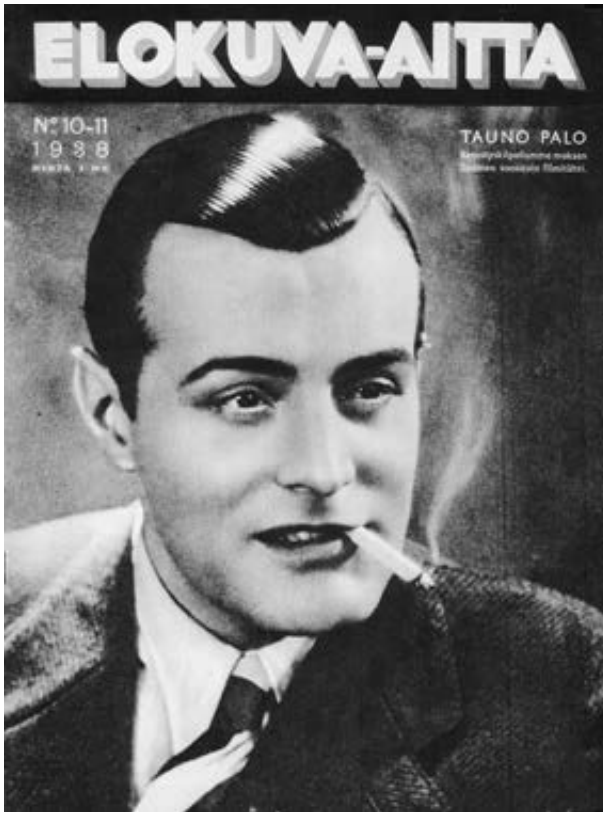
Fig. 31. On the cover of Elokuvaiitta (10–11/1938), Tauno Palo appeared as a romantic hero, his appearance resembling Clark Gable, a popular on-screen lover even in Finland.

“He has a slim body, shiny dark hair, and those dark moist eyes of a deer. The gaze is first slightly timid and wondering, but if the milieu does not seem dangerous, they soon will smile trustingly. Tauno Palo would certainly have the potential to become a very romantic hero if he had more of a gallant personality. Now he seems very polite and kind.” 105