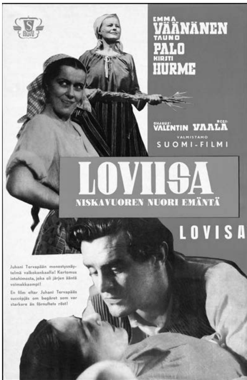
Fig. 44. The poster framed Loviisa 1946 (FFA) as a love triangle, emphasizing conflicts and illegitimate passions.