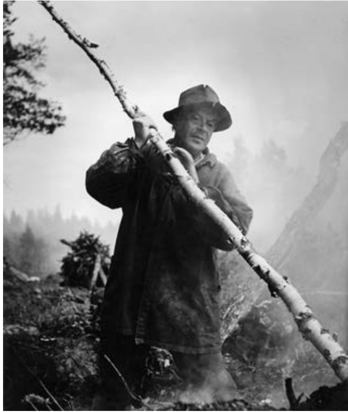
Fig. 37. Akusti as the exemplary Finnish peasant in Heta Niskavuori 1952 (FFA).