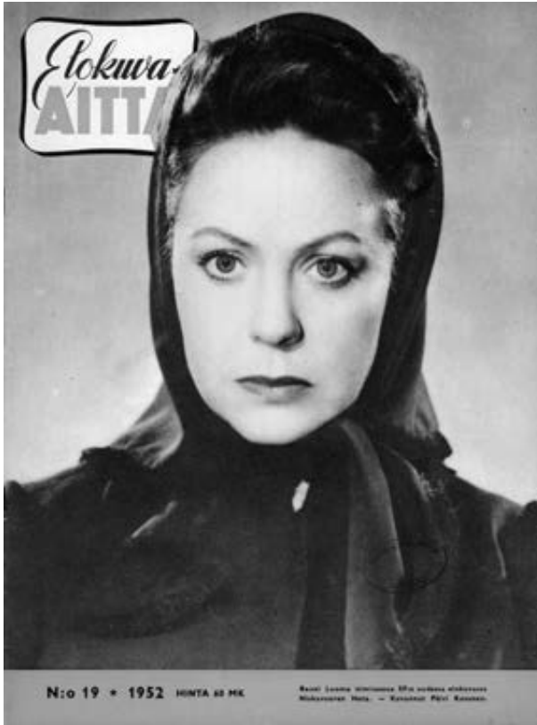
Fig. 22. The cover of Elokuva-aitta (19/1952) represented Heta as a dauntless peasant woman without a smile on her face.

material and the earthly”, and thus, completely lacking “the wise ability to adjust herself, which is what makes the old female characters of Tervapää so pleasant and so grand”. 219 In this manner, then, Heta was framed as the negative of Loviisa, as her definitional other (cf. Sedgwick 1992, 241).